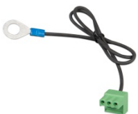
Connector with preassembled DC minus cable (included)

The BatteryProtect disconnects the battery from non essential loads before it is completely discharged (which would damage the battery) or before it has insufficient power left to crank the engine.