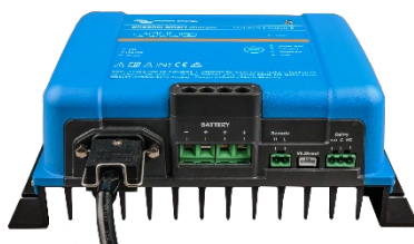
Phoenix Smart 12/50(3)